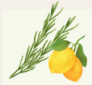
Rosemary lemon (F+E)