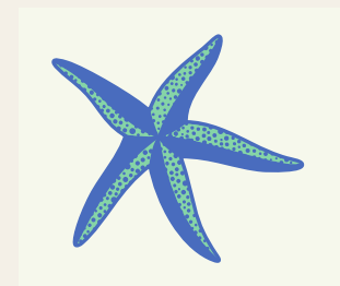
Ocean Breeze (F)