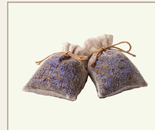
Lavender pouch $5.50