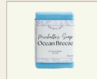
Mini soaps $5.50