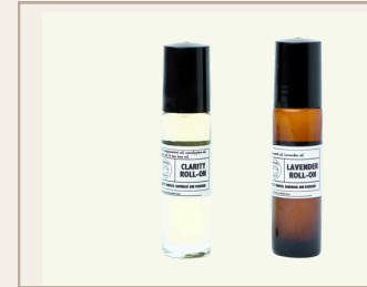
Lavender Roll-On $8.50