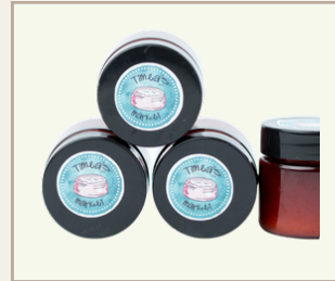
1 oz Shea Body Butter $4.50