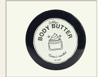
2 oz Shea body butter $6.50